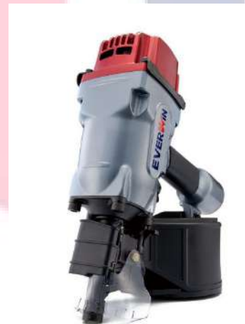
PN65M INDUSTRIAL 65mm Wire Coil Nailer

Pallets & Crates // Framing, sheathing & decking in general construction // Finish & wood working for fine carpentry and interior decoration // Furniture & upholstery & bedding // Manufactured/ prefabricated housing // Carton packaging // Automation.