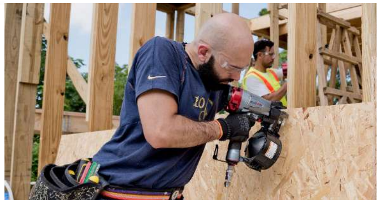
SCN51 UTILITY 50mm Wire/Plastic Coil Nailer

A.C: While the tool manufacturing industry is very developed, we pay close attention to user habits in different applications. We don't focus heavily on DIY market, or low-end tools, rather we have developed our reputation in the industrial manufacturing market. We try to focus on the needs of the most demanding individuals out there. With that we continue our investment in industrial automation.