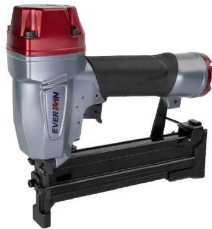
FS9040 narrow gauge crown stapler