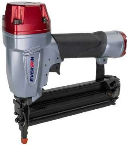
FN1850 18-gauge brad nailer

valves, offers an immediate upgrade to automation users that are looking to boost efficiency while minimizing maintenance rates.